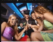
What I tell people I do.