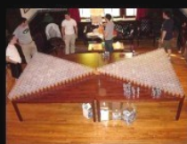
What society thinks I do.