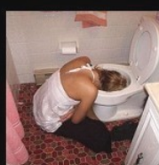
What I actually do.