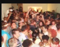
What I think I do.