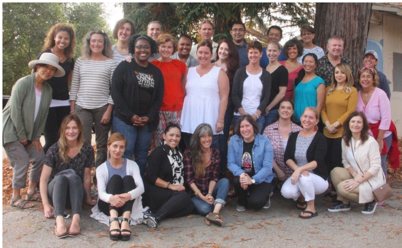
CAPS staff, September 2017.