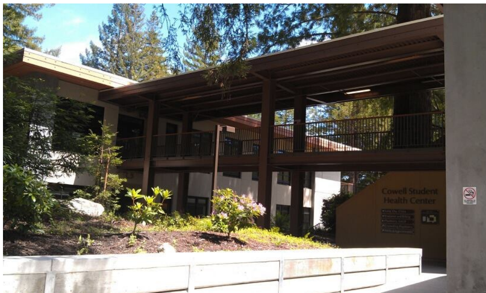
CAPS is located on the second floor of the East Wing of the Student Health Center, above the pharmacy.

CAPS offers other services, too, like this newsletter, our Facebook page and blog , and special outreach events, to name a few. Check out our website to learn more about all of the services mentioned in this article and see schedules for fall quarter!